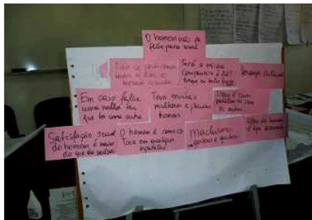
Using activity Condom Wall, adapted to a Faithfulness Wall to help participants explore and address reasons why they might have multiple concurrent partners.