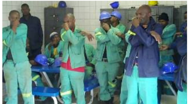
Using Activity: Wildfire in the staff tea room

As with all Bridges of Hope training of trainers programmes, this included a 'Real Life Training Practice' session on the last day including community outreach using Bridges of Hope activities in the nearby town of Brits and other sessions engaging Hercul work colleagues in the staff tea room and outside the canteen.