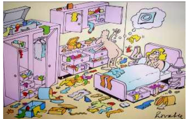
by RONALDO - Brazil