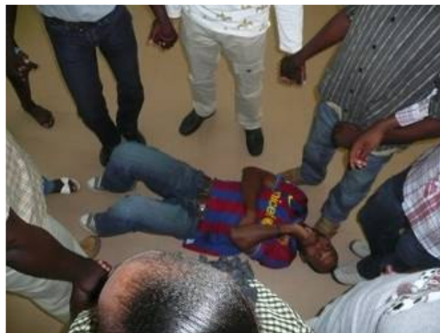
A 'fetus' surrounded by the 'uterus' during the activity on Preventing Parent to Child Transmission during pregnancy and birth.