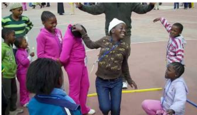
Facilitating What happens in the body with a group of young participants at a community centre.

Some of the artwork displayed inside the bus: