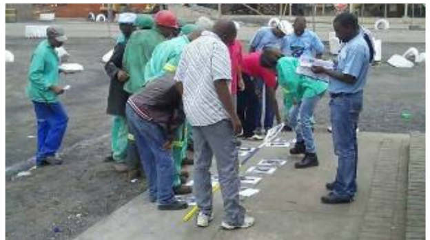
Using Activity: Can you tell? outside the staff canteen

Practicing the activity What happens in the body : the White Blood Cell (immune system) finally manages to expel an Infection from the body.